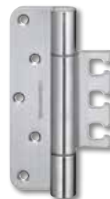
VARIANT VBRplus for high performance heavy-duty doors, load capacities up to 400 kg