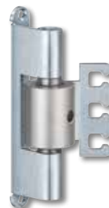
VARIANT Finger Protection for doors with finger protection specifications, load capacities up to 120 kg