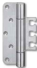
VARIANT VX model versions available in knuckle lengths of 100 mm, 120 mm and 160 mm