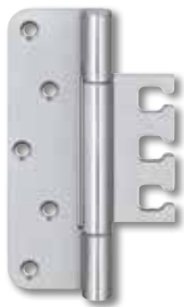
VARIANT Planum with reduced, elegant knuckle, load capacities up to 160 kg