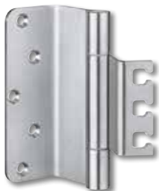
VARIANT Care swing-clear hinge for unrebated heavy-duty doors in health care facilities, load capacities up to 100 kg