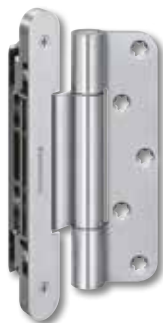
VARIANT Compact with adjustment in the door leaf, load capacities from 120 to 160 kg